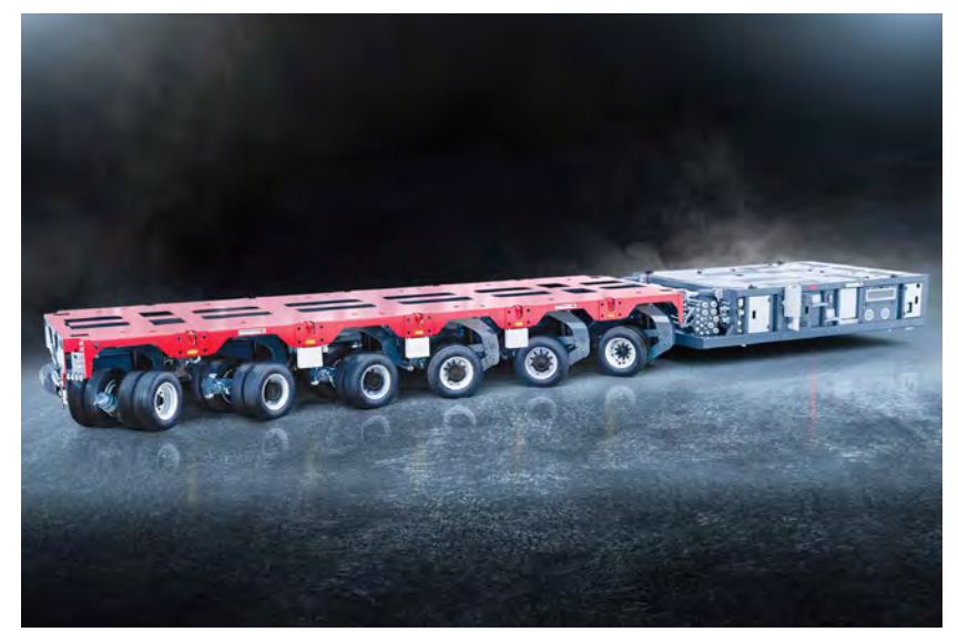
24 // ModulMAX AP-M - Check out the 3-in-1 solution