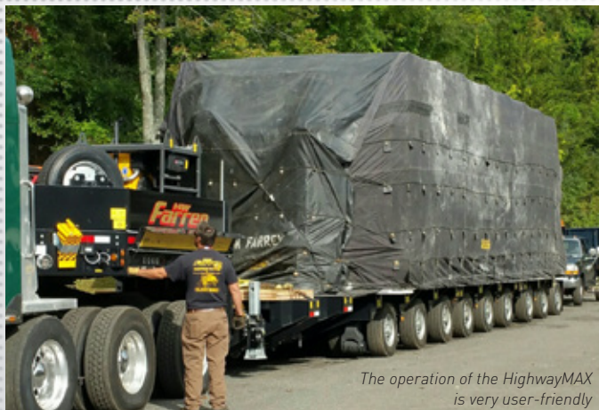
The operation of the HighwayMAX is very user-friendly

Faymonville is driving the transport world in North America wild. The operation of the vehicle is very user-friendly and thanks to its king-pin steering, it follows the truck ideally also around narrow corners. The net weight of 62,500 lbs is optimal, excellent payloads of up to 258,000 lbs can be reached for the different transport tasks. The full package of technical advantages appealed to Erik Zander.