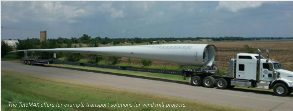
The TeleMAX offers for example transport solutions for wind mill projects.