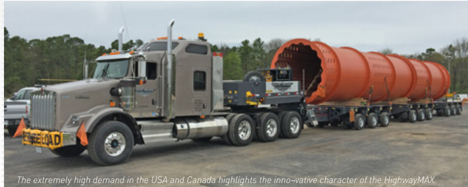
The extremely high demand in the USA and Canada highlights the innovative character of the HighwayMAX.

"We really enjoy the automatic steering, it works very well. The trailer requires much less labor and supervision to operate from other conventional setups we have".