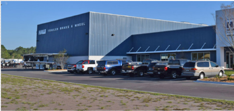
Hale is the largest independent trailer dealership in North America.