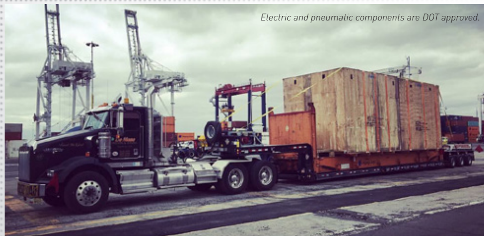
Electric and pneumatic components are DOT approved.

"We are fortunate to have been able to include the Faymonville to our trailer pool. We are now able to quote much bigger