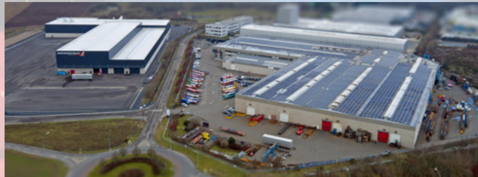
The two production facilities in Luxembourg with a total surface of 390,192 sq ft.

The modern production facilities in Belgium (surface 319,957 sq ft), Luxembourg (surface 390,192 sq ft) and Poland (226,042 sq ft) combine high tech