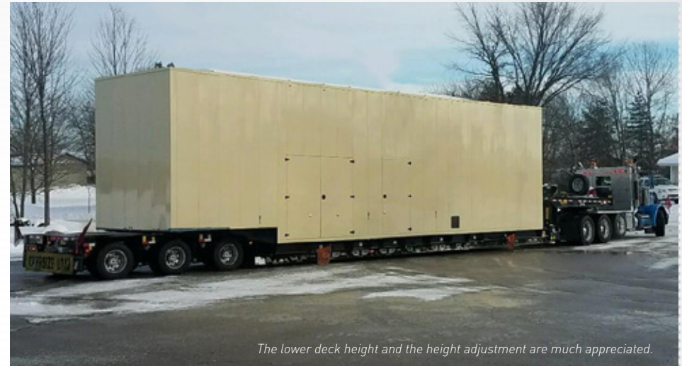
The lower deck height and the height adjustment are much appreciated.

projects with the Faymonville addition, and are looking into purchasing more", concludes Jim Moeschen from De Mase Trucking Co., Inc., happy to have this flexible vehicle in his fleet now.